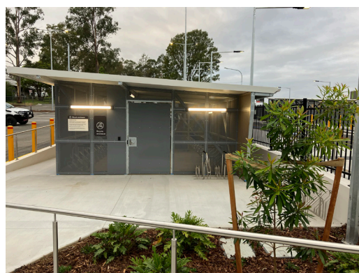
Bicycle lock up enclosure with new security swipe

Thank you for your support over the past nine and a half months. We hope you enjoy your new station.