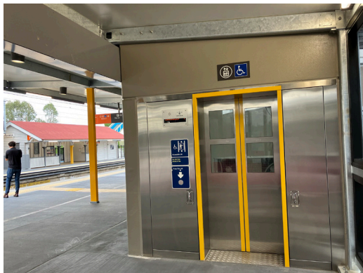
Lift access to platforms