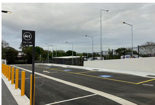
Kiss 'n' ride and accessible parking