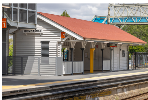
Station heritage features retained