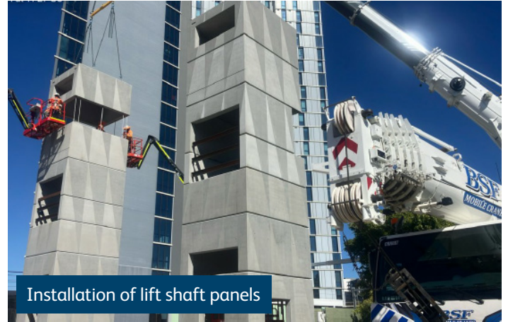
Installation of lift shaft panels

Thank you to all the entrants who submitted photos.