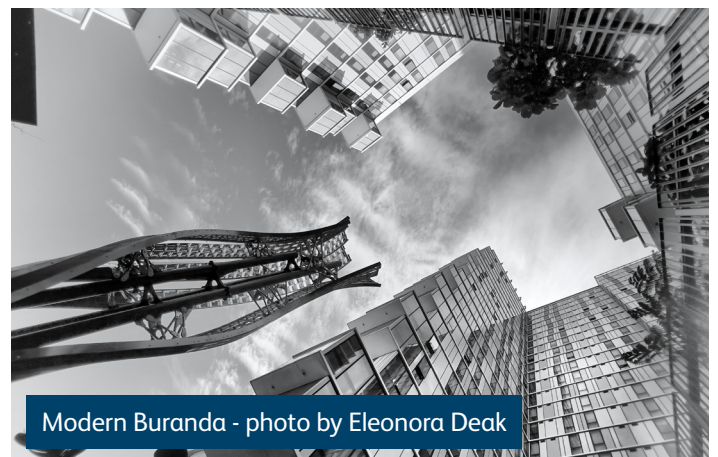
Modern Buranda