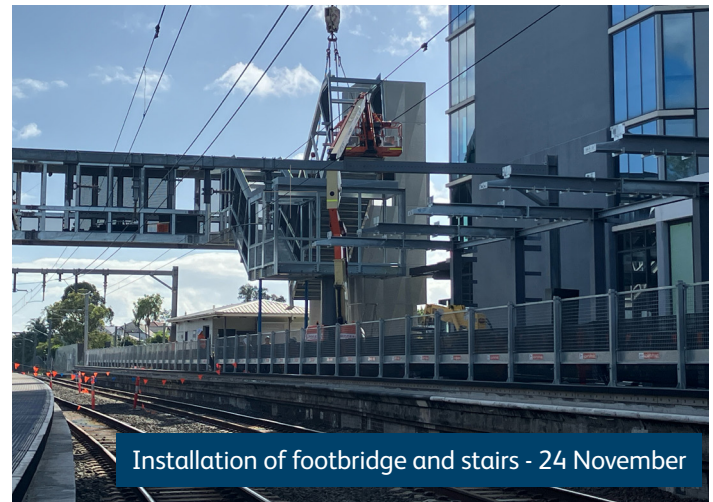
Installation of footbridge and stairs - 24 November