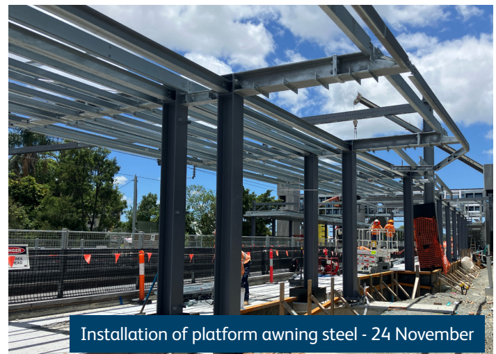
Installation of platform awning steel - 24 November