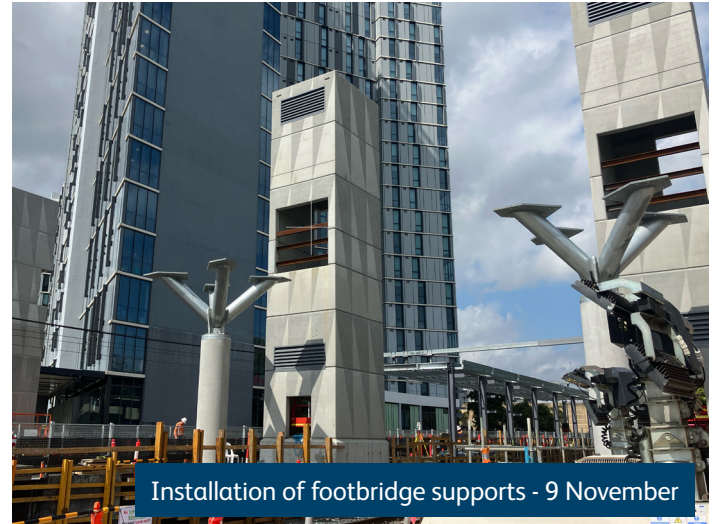
Installation of footbridge supports - 9 November