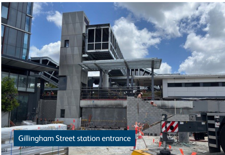
Gillingham Street station entrance