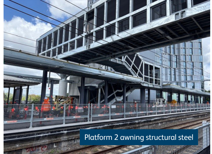
Platform 2 awning structural steel