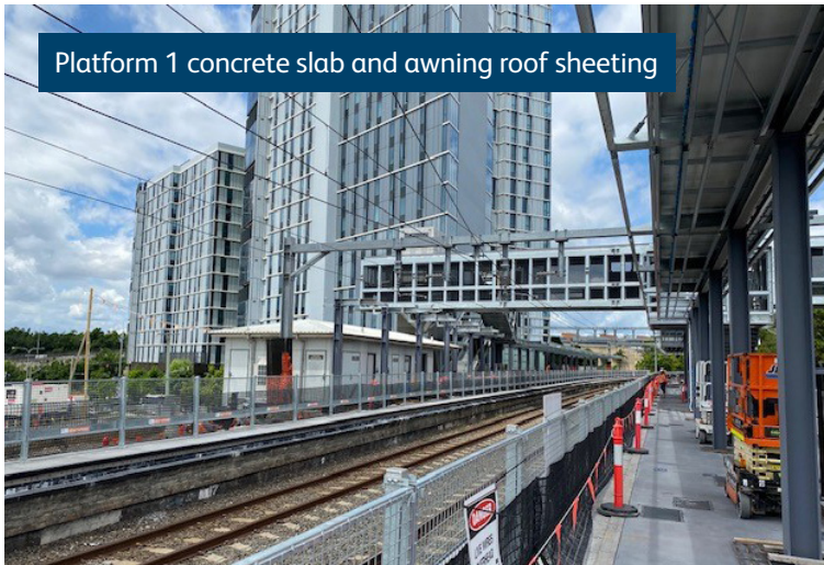
Platform 1 concrete slab and awning roof sheeting