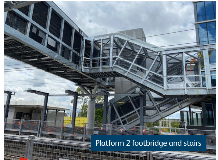
Platform 2 footbridge and stairs