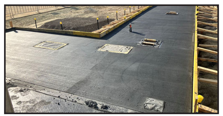
Lift entry concrete pour (above)