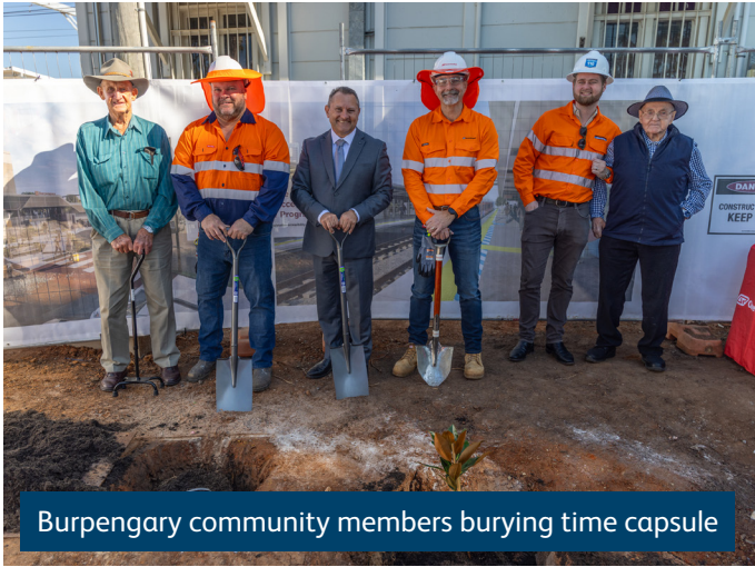
Burpengary community members burying time capsule