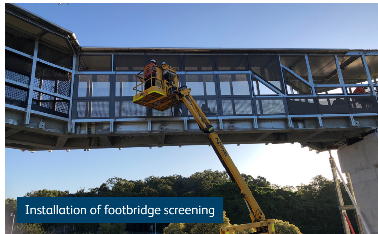
Installation of footbridge screening