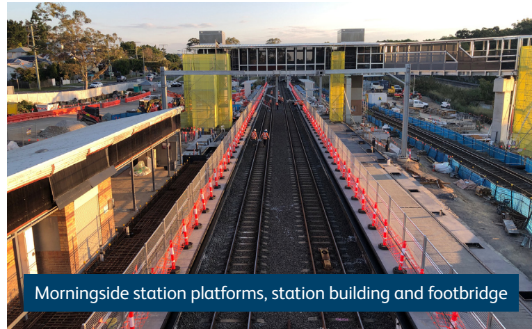
Morningside station platforms, station building and footbridge

Thank you to all the entrants who submitted photos.